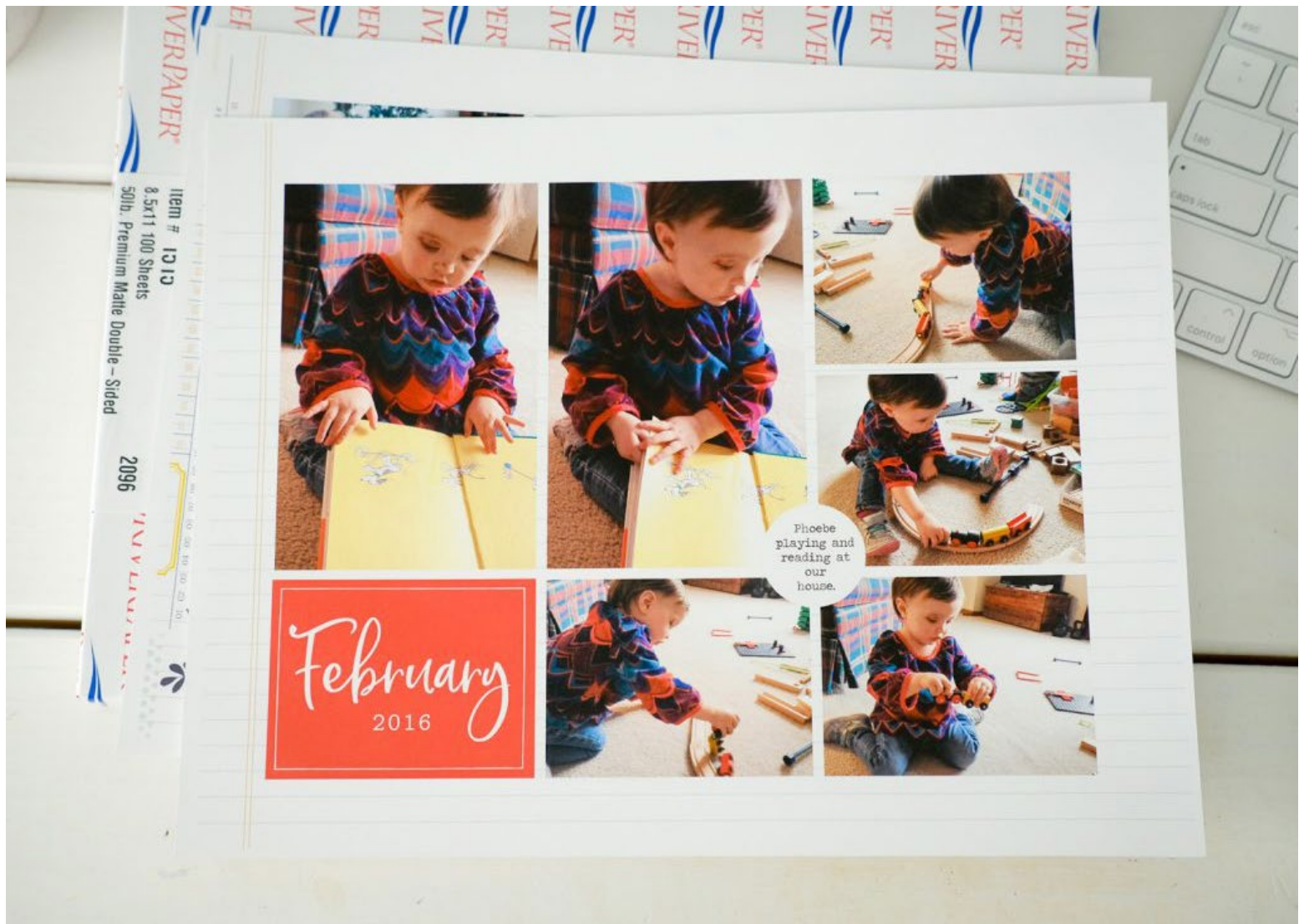
Closer view of a page

One quick tip for using the Cinch; be sure your pages are pushed all the way to the back. I wasn't careful and ended up having to reprint a whole group of pages. I'm going to only punch one page at a time for a while in case I mess up and have to reprint.