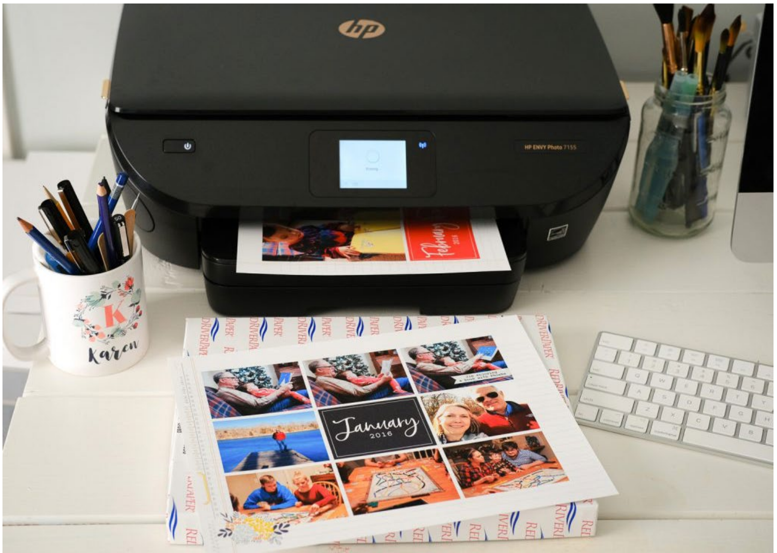
Printing my photo book

Once my pages were printed I bound them with a book binding system called the Cinch by We R Memory Keepers. I used heavy chip board for the covers and 1/2 wire bindings that I bought in bulk on Amazon. I printed a title page and used glue tape to adhere it to the front cover. Next time I'm going to use scrapbook paper and wrap the chip board with it before punching for a more finished look.