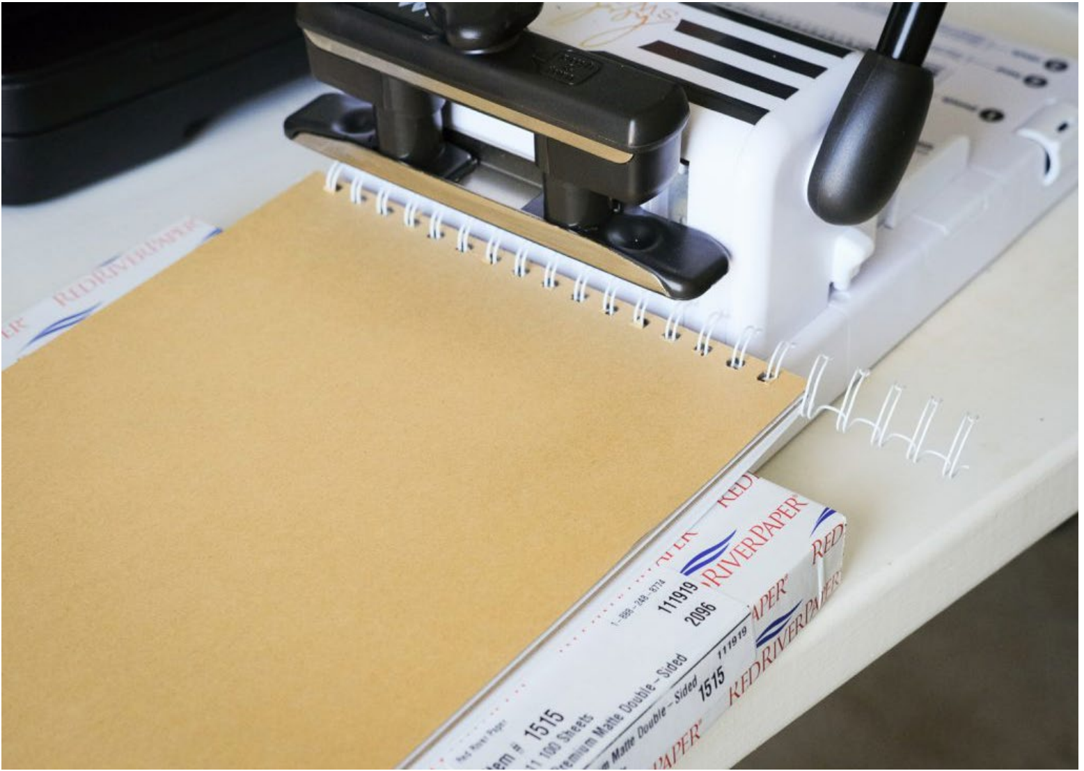
Crimping the wire