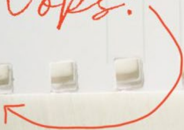
Didn't get my pages pushed back all the way