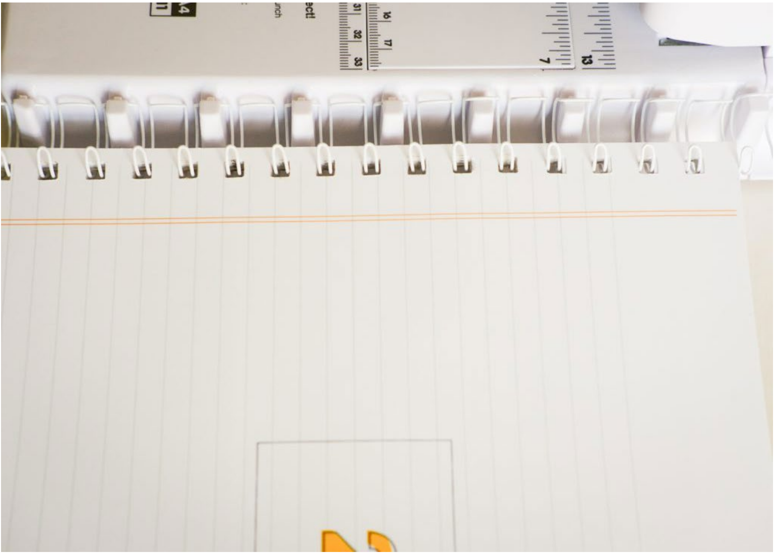
Adding pages to the wires