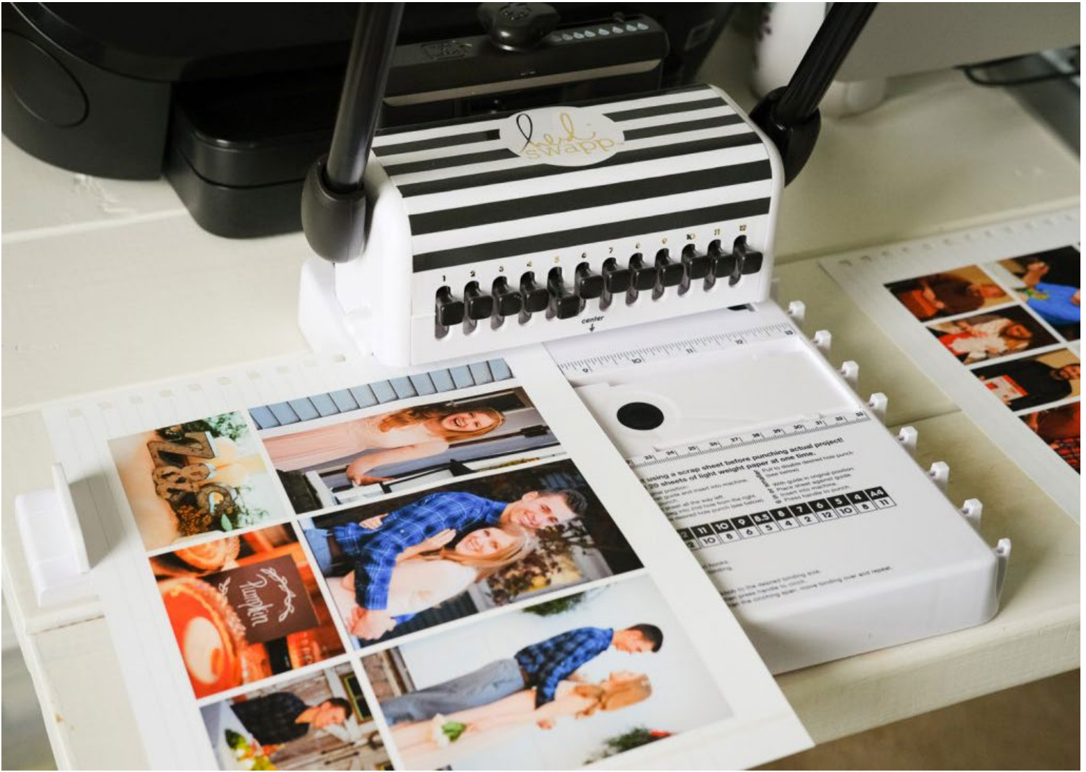
Punching the pages